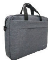
dynabook Lifestyle Case