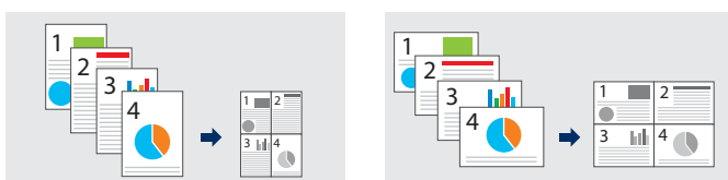
4IN1 : Copies four pages on a sheet of paper in portrait or landscape orientation.